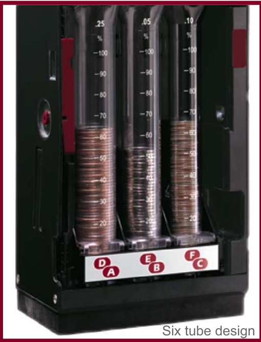
Six tube design