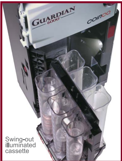
Swing-out illuminated cassette